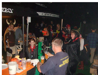
From our Halloween Party 2010